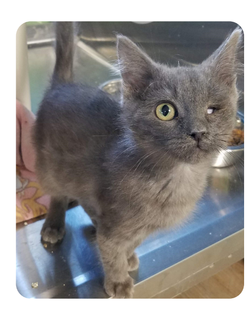
Buck is a two month old kitten found on the side of a road. He is missing an eye and will require surgery to help him feel better.