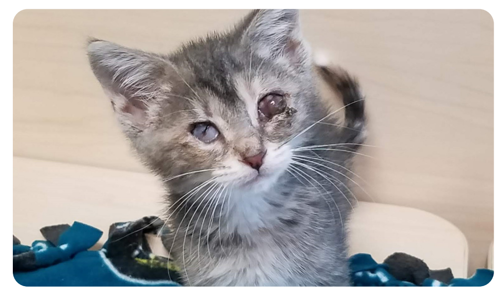
Sparrow is a one month old kitten found as a stray. She was so sick with a severe upper respiratory infection when she arrived at the shelter. Because the infection was never treated before coming to us, her eyes were affected and she will need both eyes removed. Regardless of how she looks, Sparrow is a happy, playful kitten and her condition does not slow her down one bit.